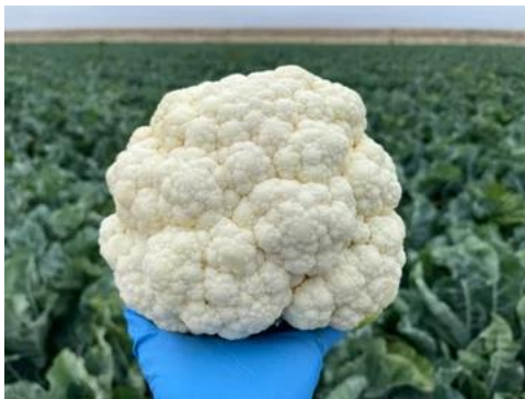
Cauliflower, from Salinas, CA