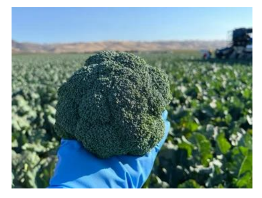
Broccoli, from Salinas, CA