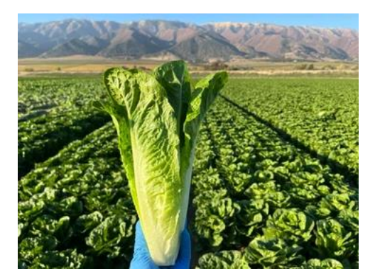
Romaine Hearts, from Salinas, CA