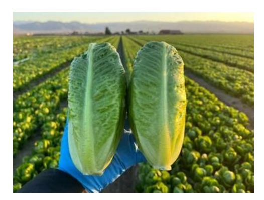
Baby Romaine, from Salinas, Ca